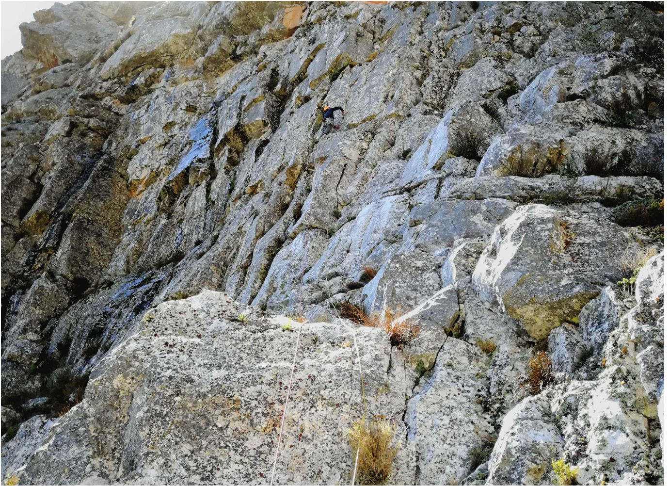
Brent leading pitch 4 toward the square orange rock patch.